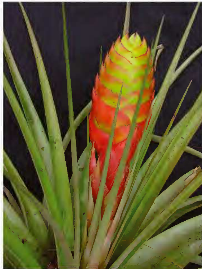
Fig. 2. Tillandsia jalisco monticola Matuda ( J. Ceja et al. 1473).